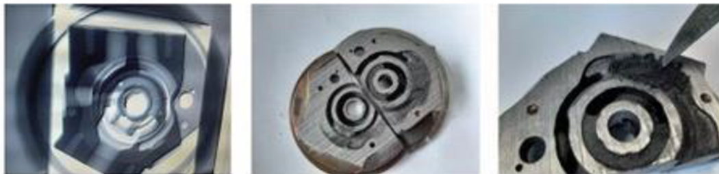
Figure 3: Residual sand inside the water channel after X-ray analysis and in the real turbocharger body section

As part of the structured problem solving (using the 8D report) it was important to find the cause(s) of the residual sand in the water channel. To fulfil this aim, a multifunctional team was created consisting of personnel from different/relevant departments (e.g. engineering, quality, technology, production). This team defined the probable causes of the problem using the C-E diagram. The outputs from the diagram are summarised in Table 1.