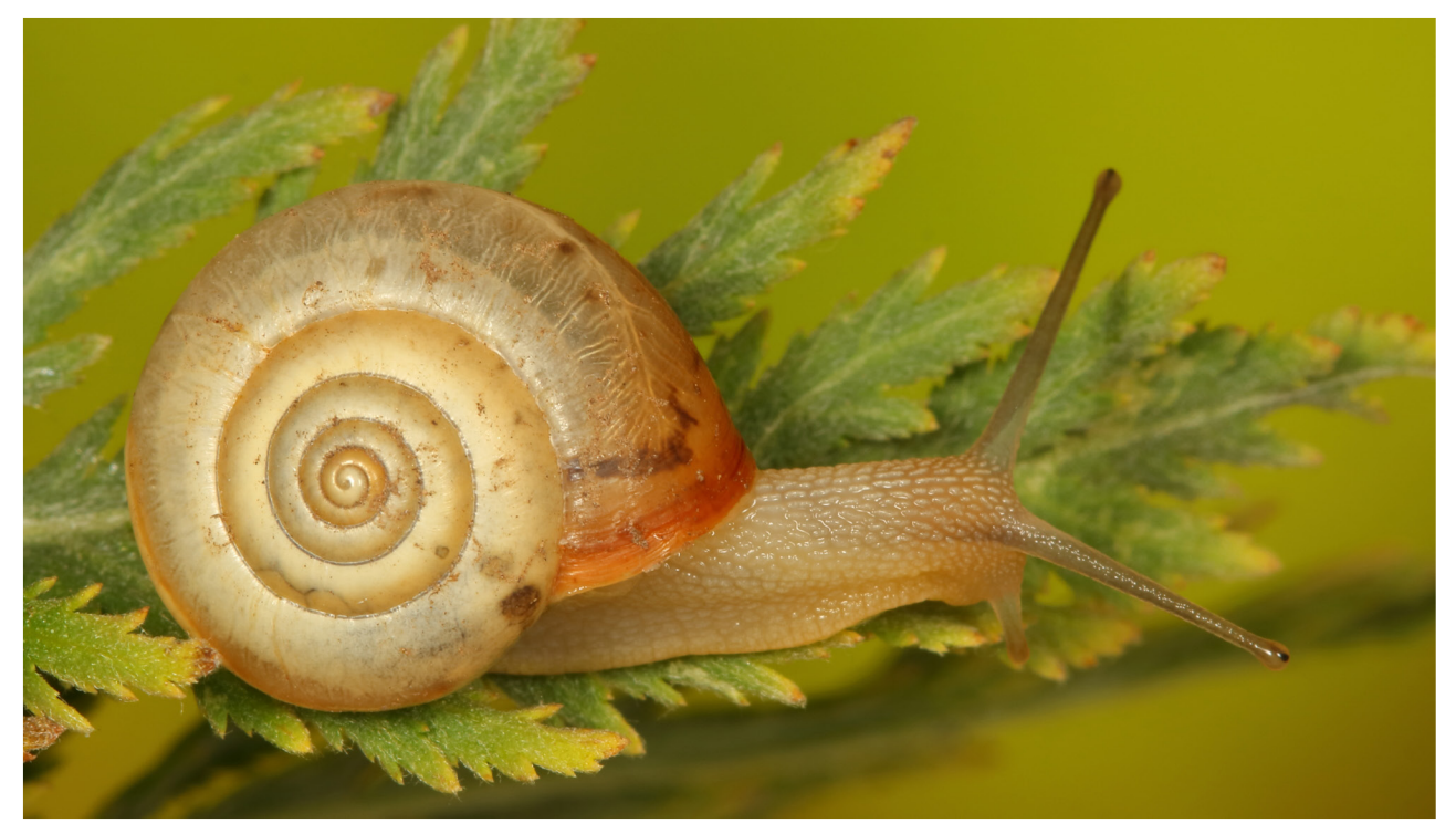
Fig. 9. Monacha cartusiana from Olomouc, CZ.

site is outside of its previously known range in Slovakia (Horsák et al. 2020).