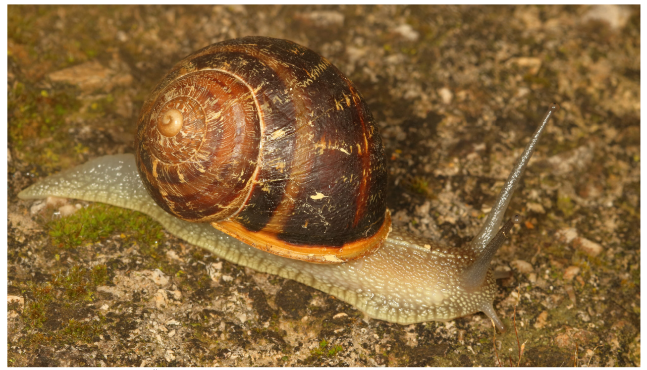
Fig. 5. Cornu aspersum from Žuljana town, HR.