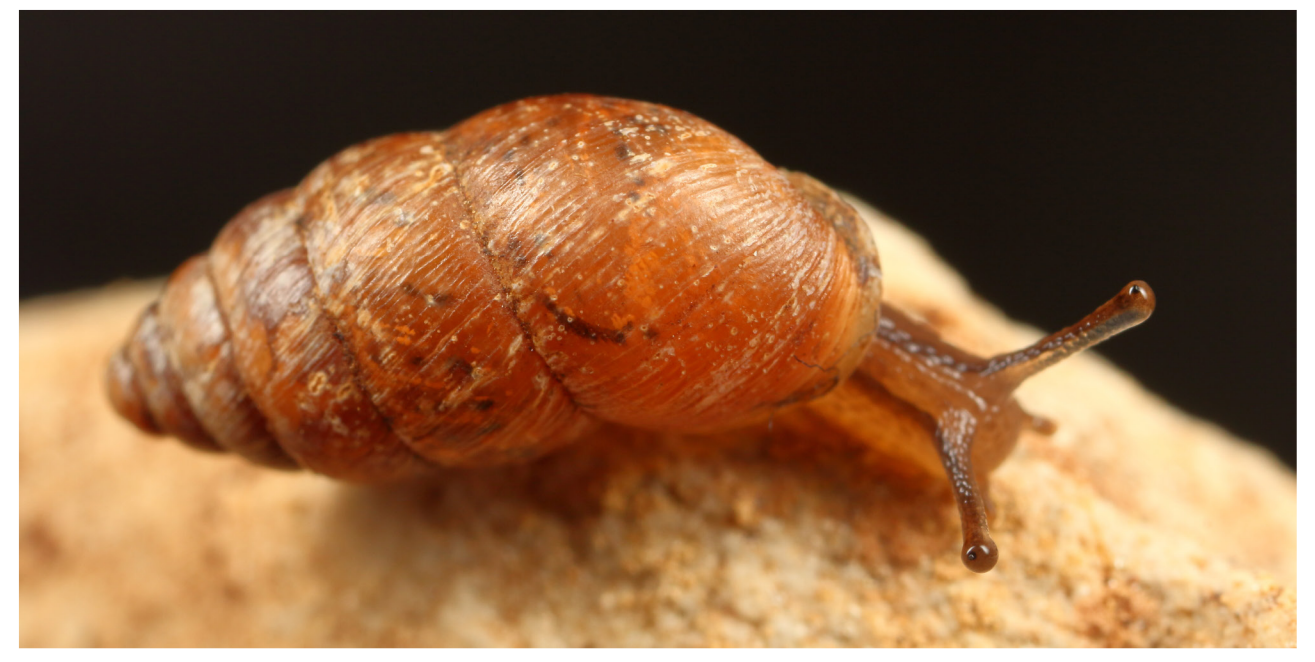
Fig. 3. Chondrula tridens from Toužínské stráně NM, Dačice, CZ.

first finding outside the garden centers also comes from Bratislava City, from the Danube embankment, a small space between buildings with a lawn, ivy and several trees.