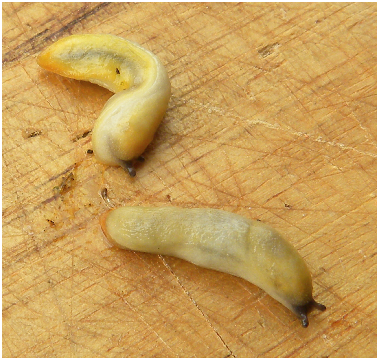
Fig. 2. Arion intermedius from Bratislava City, SK.