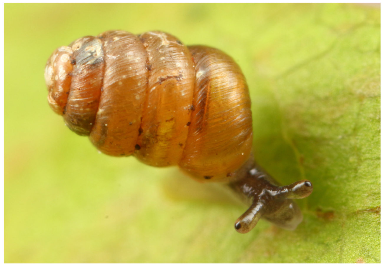
Fig. 4. Columella aspera from the Hadí vrch NR, Staré město pod Landštějnem, CZ.

between C. dubiosa corcontica and C. laminata indicates the possibility of hybridization between these taxa. Four representatives of such morphotypes were selected from two different Krkonoše localities (two from each locality). At both studied localities, the 16S rRNA haplotypes of the transient morphotypes corresponded exactly to the C. laminata or C. dubiosa corcontica that occurred at the same locality.