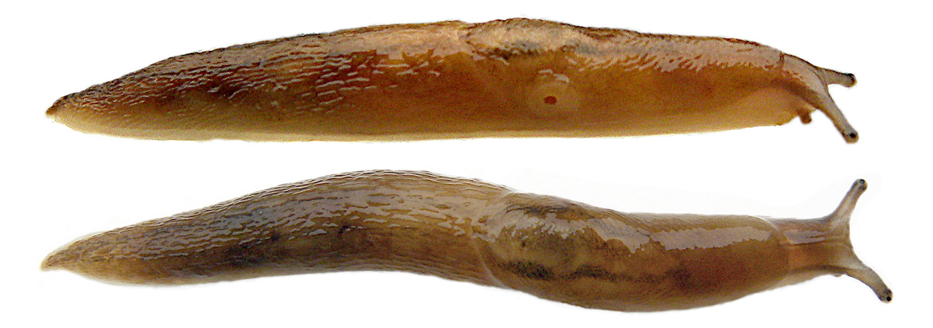
Fig. 1. The slug Ambigolimax valentianus from Bratislava City, SK.