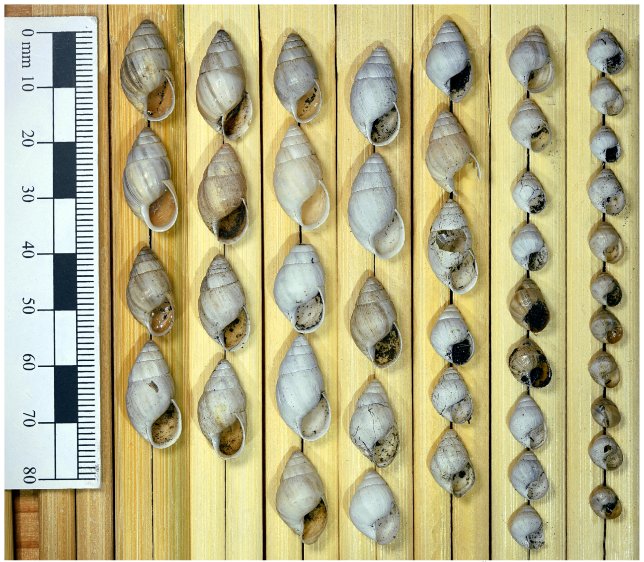
Fig. 10. Variability of Zebrina detrita from the Prokopské údolí Nature Reserve, CZ.

New records come mostly from within its areas of known occurrence, e.g. from the floodplain of the rivers Dyje and Morava (southeastern Moravia) or the floodplain of the river Odra. Its occurrence was also confirmed in an isolated small lake in the České středohoří PLA.