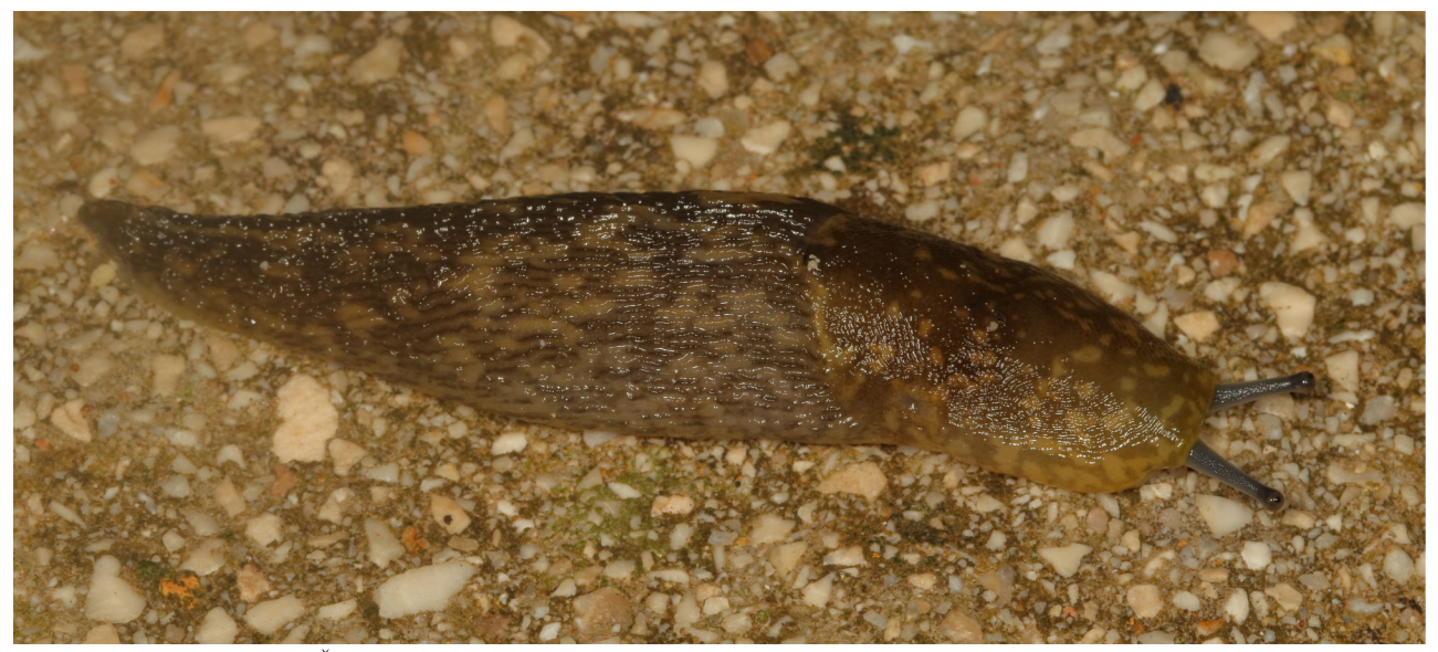
Fig. 7. Limacus flavus from Žuljana town, HR.

the nocturnal occurrence of three individuals under and around a trough with chives in her garden in the town of Lužice near Hodonín. The identification was made by one of the authors based on available photographs (Fig. 7).