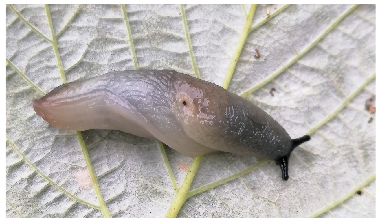
Fig. 6. Krynickillus melanocephalus from the vicinity of the village of Hervartov, Eastern Slovakia.

sive lowlands along the biggest rivers in the Czech Republic and Slovakia. Some notable records outside its known range in the Czech Republic (Horsák et al. 2020) were documented in 2020.